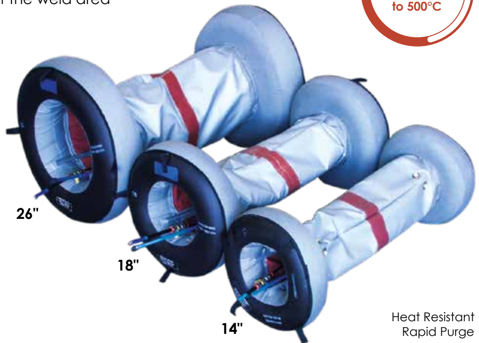
Heat Resistant Rapid Purge e.g. 36" Pipe will purge in less than 10 minutes!